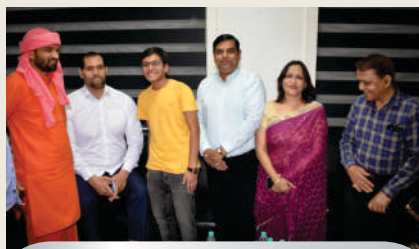
The Great Khali

Visited the university on 25th of June 2022 to inaugurate the national conference. "The ambience culture, discipline and spark exist in all OSGU family. Hope it will be a very important destination for students in time to come. The leadership is visionary, god bless the team, best wishes".