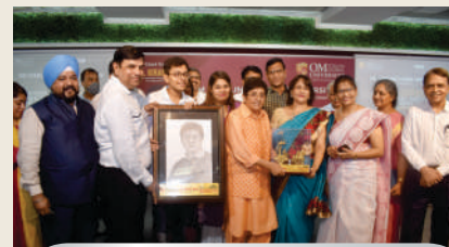
Dr. Kiran Bedi

Congratulations to all the students, faculty and management of the Om Sterling Global University, Hisar, on their first convocation. May the university grow and excel in times to come.