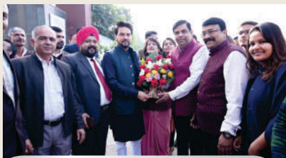
Mr. Anurag Thakur

Minister of Youth Affairs and Sports of India